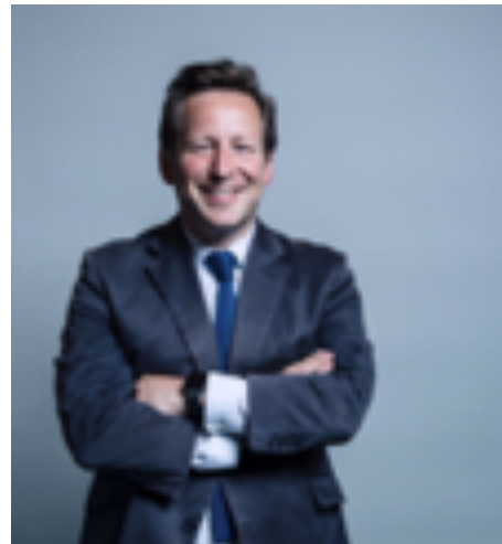
Rt. Hon. Ed Vaizey MP, Vice Chair