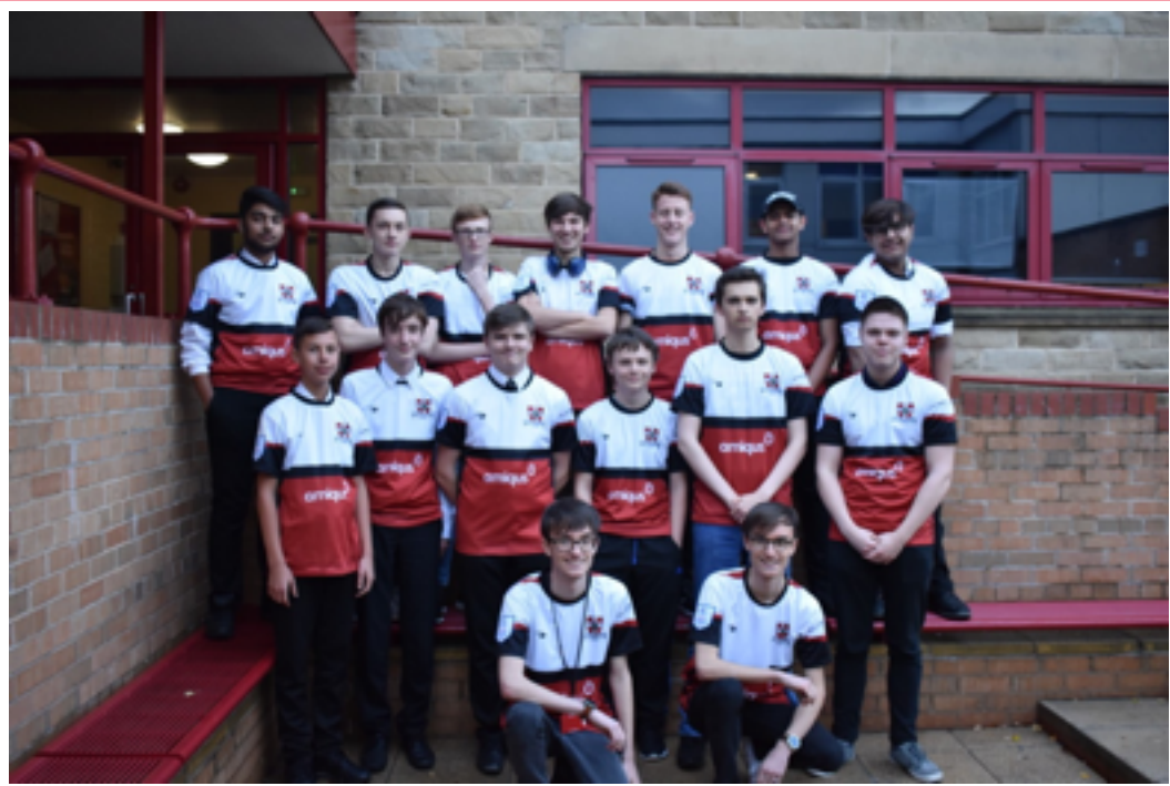
THE FISHER FALCONS FROM ST JOHN FISHER CATHOLIC VOLUNTARY ACADEMY SHOWING OFF THEIR CUSTOM JERSEYS